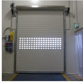
Compact side guide design