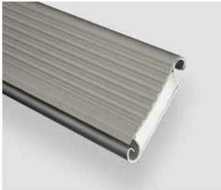
Insulated Slat – back view