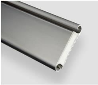
Insulated Slat – front view