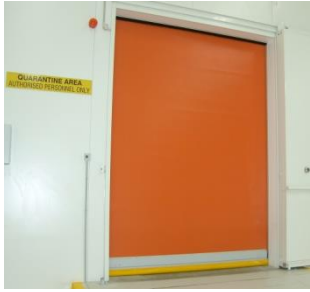
MAX Doors TOUGHFLEX® door curtain