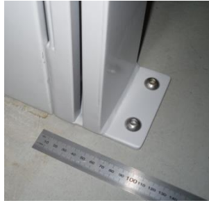
Compact Guide Design