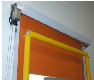
Durable solid steel construction