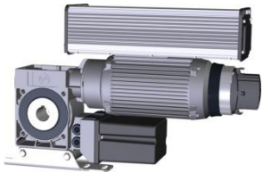
240v Single Phase GfA Safedrive