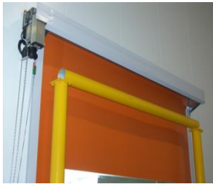
Durable solid steel construction