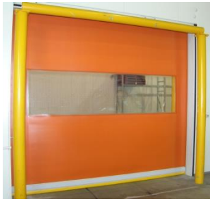
MAX Doors TOUGHFLEX® door curtain