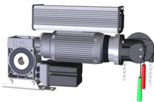
240v Single Phase GfA SafeDrive®